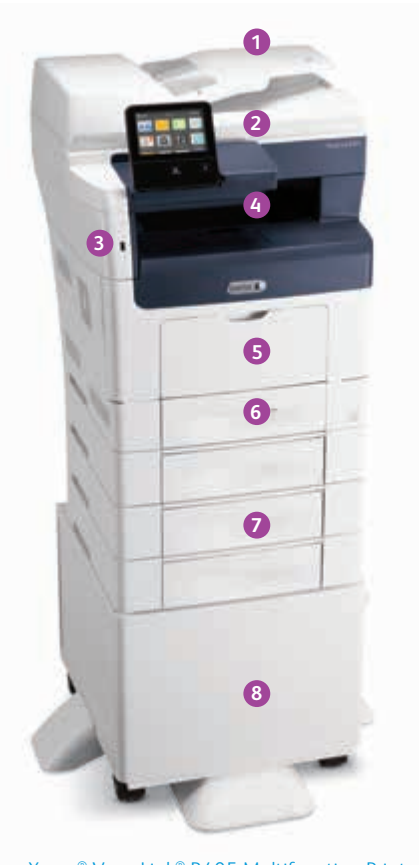
Xerox<sup>®</sup> VersaLink<sup>®</sup> B405 Multifunction Printer Print. Copy. Scan. Fax. Email.