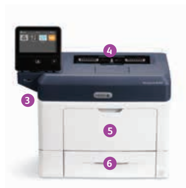
Xerox® VersaLink® B400 Printer Print.